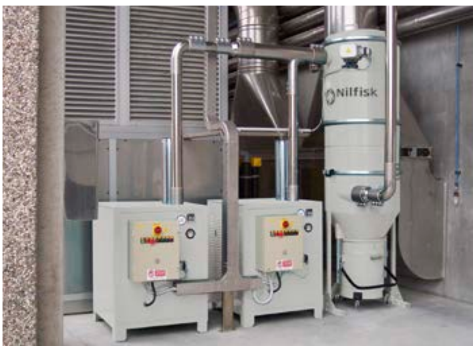
Centralized vacuum system in a chemical company: 2 vacuum units, 1 filter silo.

Centralized vacuum systems are the ideal solution for vacuum applications required in several places simultaneously, and in large environments that may have very different features. ATEX certified systems are often the only choice for large industrial production.