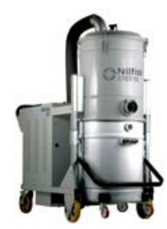
7.5 kW three-phase up to 18.5