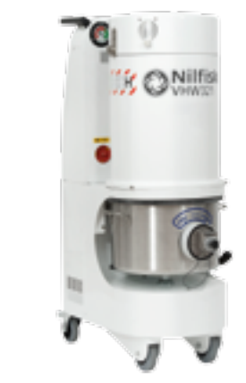
Three-phase up to 4 kW