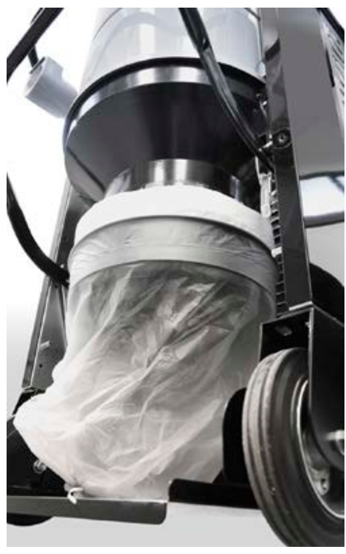
Longopac® "endless" collection system

For more information, contact customer service +39 059 9730000. Send an e-mail to info@nilfisk-cfm.com or visit our website industrial-vacuum.nilfisk.com.