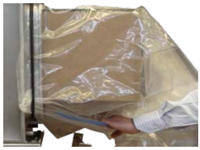
Bag-In Bag-Out filter system