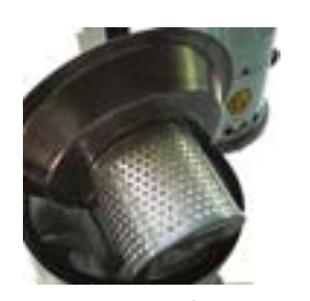
HEPA 14 Absolute filter