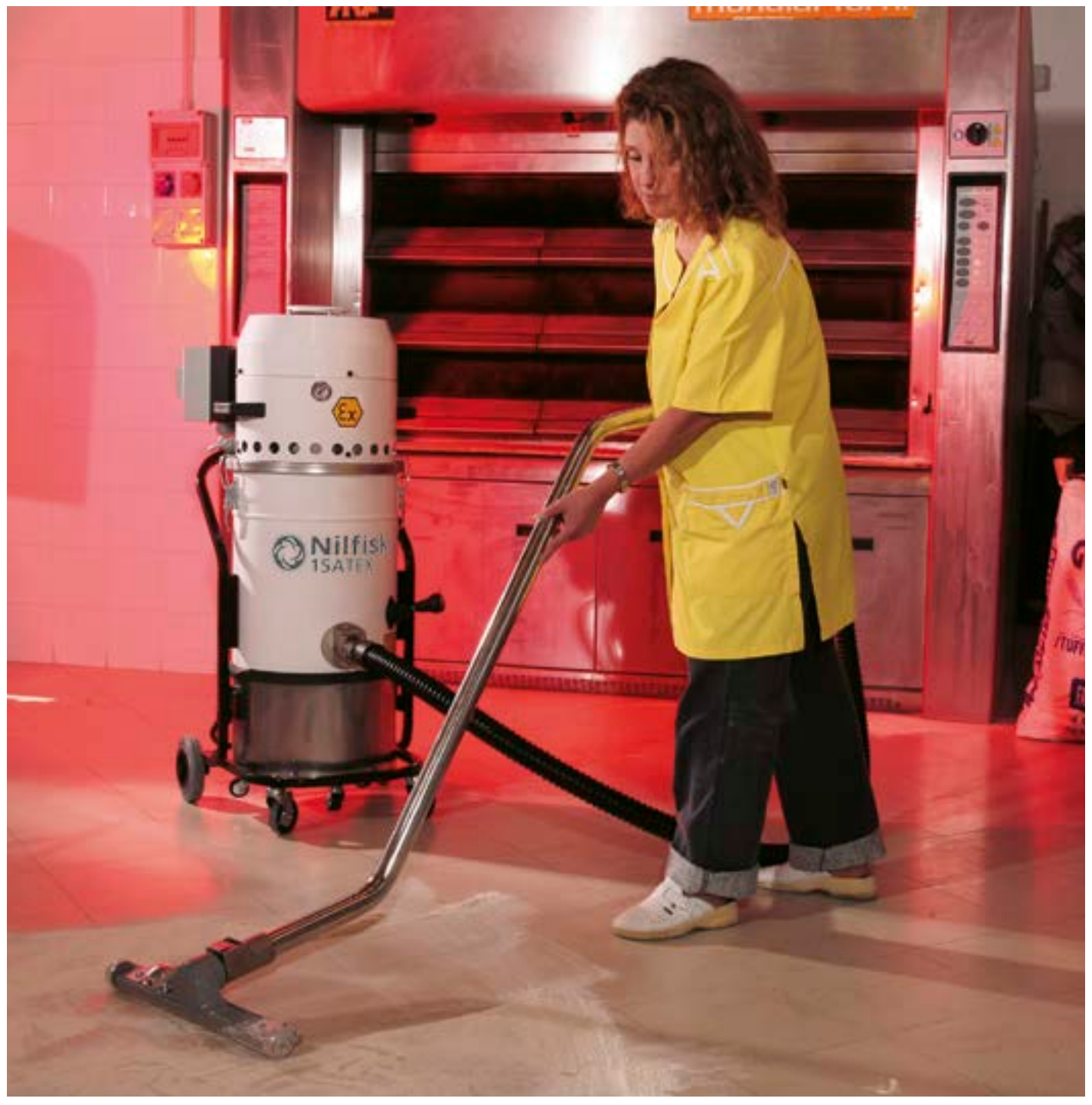
Bakery, recovery of flour from the floor.